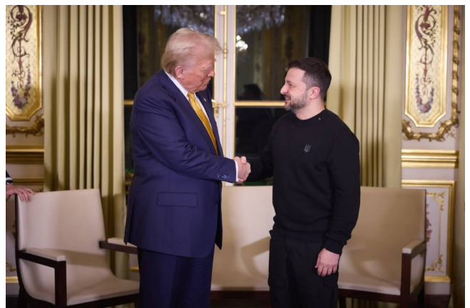
The Kremlin assumes that after the phone call, the Trump administration will be ready to quietly press Zelensky with various restrictions and limitations

Moscow will take advantage of the new American administration's halt to many Russia-related restrictions and task forces. Therefore, it will be much easier for Russian emissaries to spread Russian narratives to the American public.