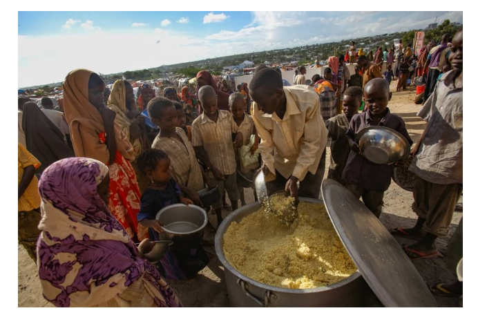
Approximately 811 million people worldwide suffer from hunger, and a significant portion of this number lives in conflict zones

However, let's not forget the approach that "everyone becomes rich with the poor's money." It wouldn't be wrong to say that the masses are deliberately and willingly left poor.