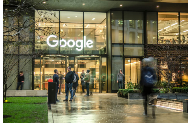
Google warned that the UK risked being left behind in the global race to develop AI unless it set out a comprehensive agenda

If Starmer’s government fails to break the deadlock in further consultations, it would have to opt for legislation.