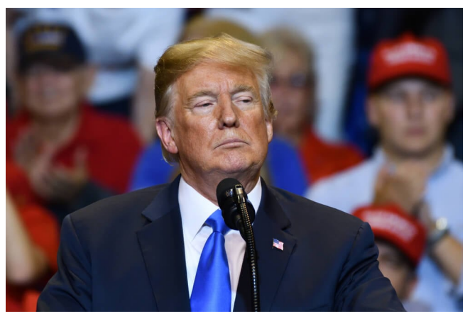
IQ measurements have featured in the US presidential campaign with Donald Trump, claiming more than once to have "aced" a cognitive test

Focused on people born before 1996, which was the year before the US banned leaded petrol, it found lead exposure cost an average of 2.6 points per person.