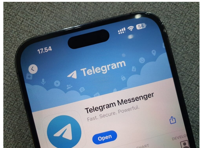
Telegram was used by Russian spies, agents, mafia members, drug dealers, and corrupt or Russian-subverted Western politicians

He was not the first to be sent to the West with a fake legend that was very attractive to at least part of the Western audience.