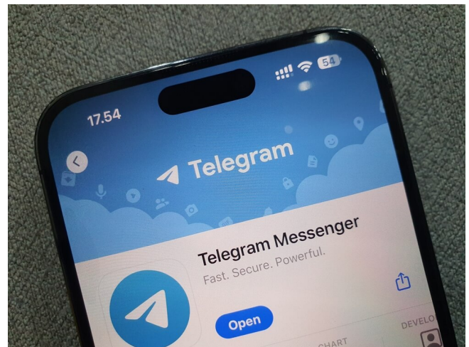
Telegram was used by Russian spies, agents, mafia members, drug dealers, and corrupt or Russian-subverted Western politicians

He was not the first to be sent to the West with a fake legend that was very attractive to at least part of the Western audience.