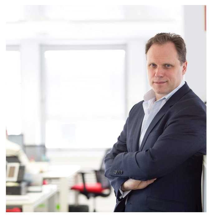
Harris' economic plan is an enormous bet on increasing the size of government and punishing the private sector -Daniel Lacalle

They forget that even in Japan, this policy has failed and now the cost of debt is almost 20% of the budget despite low borrowing costs, which has destroyed the yen.