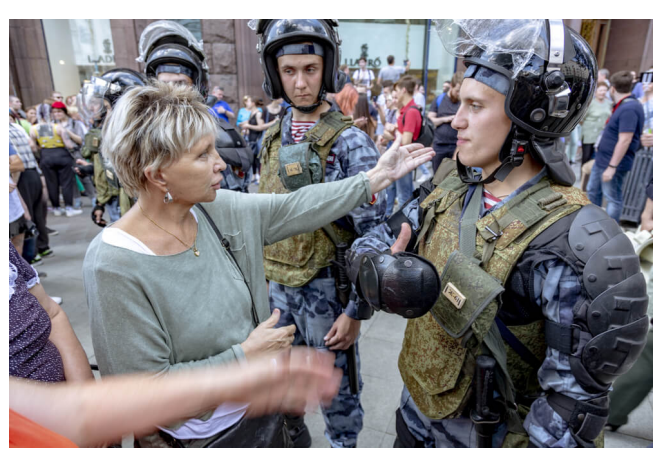
Putin expects Western concessions. His fear stems from domestic uncertainty, unrest, discontent among Moscow's elites, and discontent in Russian regions

The recent explosion of a senior intelligence officer's car in Moscow has raised concerns, particularly among high-ranking individuals. But it was neutralised very rapidly, because the suspect for planting the explosives was arrested the very next day in Bodrum, Turkey.