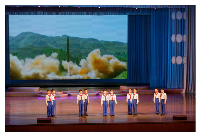
North Korea wants submarines, more powerful missiles, and satellites. Russia can offer all this

Sunday, June 23, 2024 tomorrowsaffairs.com