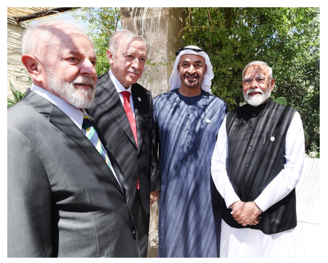
Prime Minister Modi's new government has enough room to step out of its current neutrality and take responsibility for resolving some of the current crises

However, to counter China's state-led pressure on global trade in the coming years, Prime Minister Modi's new government will need to engage much more, even if it does not fully align with the Western bloc.