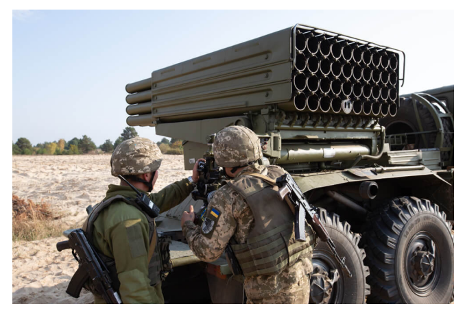
The latest US aid package to Ukraine is massive, and it will most probably be sufficient to hold back the Russian army. However, it is not enough for Ukraine to regain its territorial integrity

He is convinced that he will eventually exhaust Ukraine and the West by extending the war, something that Western politicians will not be able to explain to their voters.