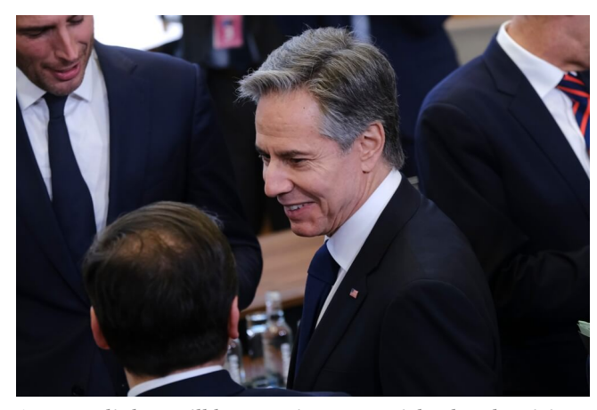
Antony Blinken will have an important job when he visits Beijing in a few weeks. This visit is the moment Beijing should use to formulate its actual response to the decisions of the US-Japan summit

However, there are very firm and visible limits to which he will have to respond. At the same time, he needs to maintain some sort of stable relations with the US, given that he needs to bring the national economy back from the current downward trend.