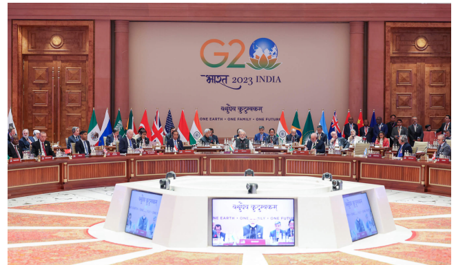
The only structure that appears as a possible ally in the recovery of the role of the AU is the G20

"The AU has ambitious institutional commitments and tools for mediation and peacekeeping but lacks the political and financial strength to make the most of them. Member states are looking inward, closely protecting their sovereign prerogatives rather than investing in collective security", stated the International Crisis Group in a report ahead of the summit in Addis Ababa.