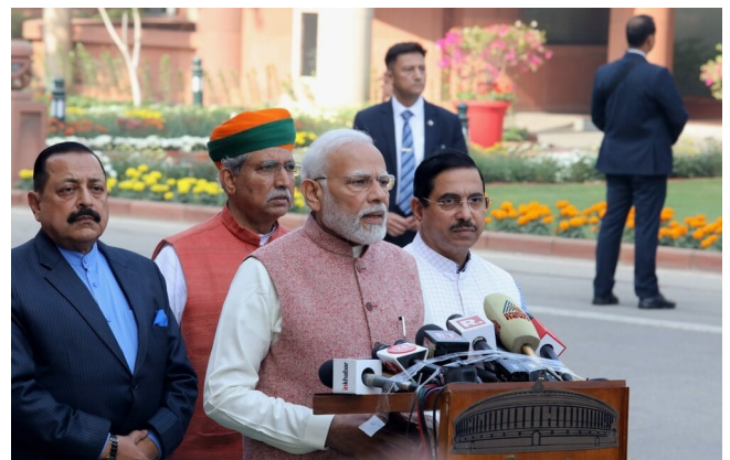
Narendra Modi's government will increase benefits and concessions to the domestic economy, including the IT sector, before the elections, which will benefit the industry

But expectations from this sector are much higher. The Government of India has outlined a plan for a much higher share of digital technology in the domestic economy, up to 20-25% by 2025-2026.