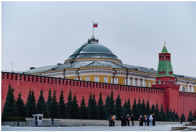
, The Kremlin made it unclear to the people in Russia that President Xi had ignored Putin's speech

As always, Russian propaganda glorified Putin's speech and his online appearance at the G20 summit. However, the Kremlin made it unclear to the people in Russia and anyone following Russian-speaking news that President Xi had ignored Putin's attempt to appeal to India, China and African countries to unite against America and the West.